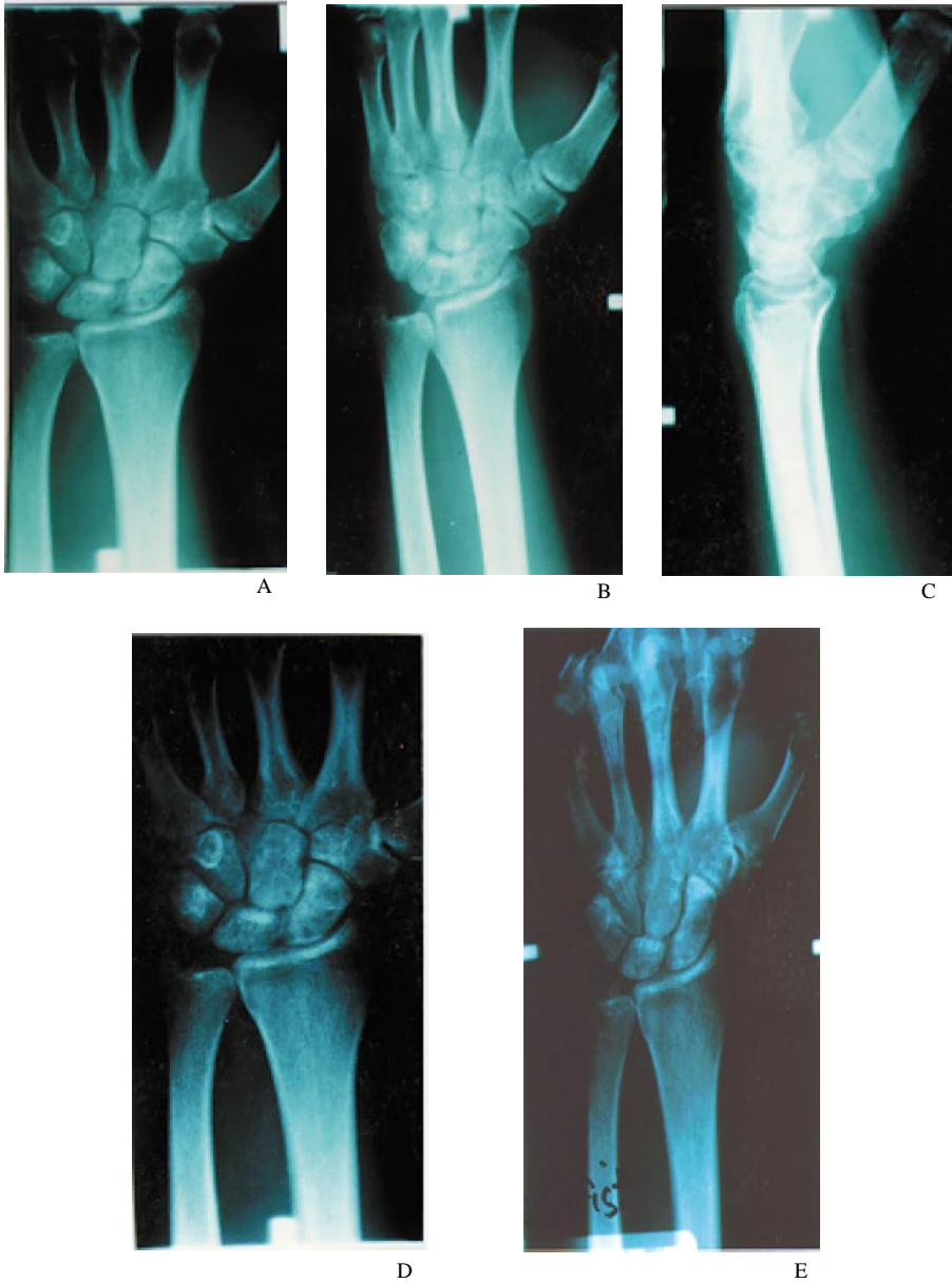
Fig. 2. Plate A: A-P view. Plate B: Oblique and lateral views. Plate C: 3 months post reduction. Plate D & E: Stability of the reduction with forceful closed fist.